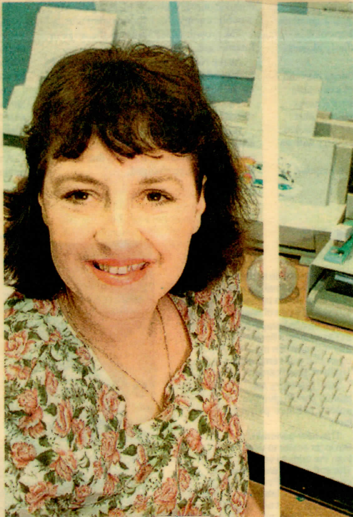
Herald Sun, Wednesday, June 14, 2000

Within weeks of setting up her own Web site — the first to offer